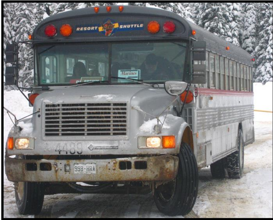
Past-their-useful-life, non-ADA compliant buses